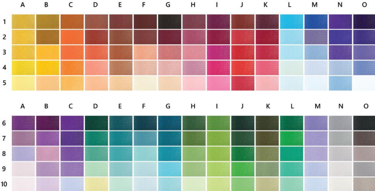
Colors may vary due to inconsistencies of various display monitors or printers (if you're viewing a printed version of this document). Color images are intended to be used as a guide only.